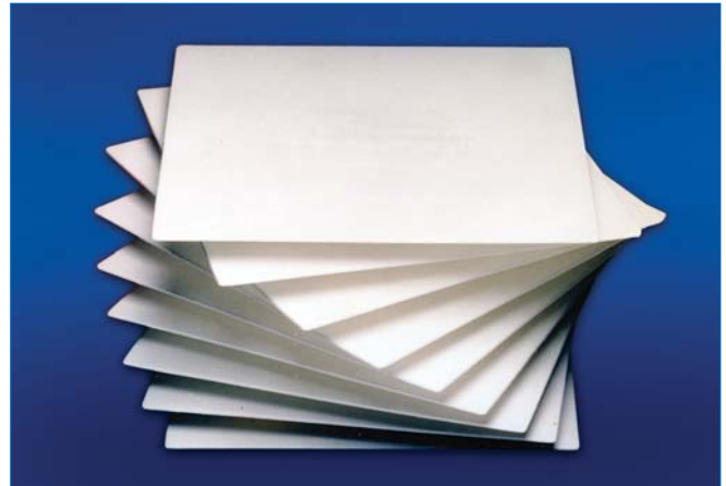
Seitz T Series Filter Sheets